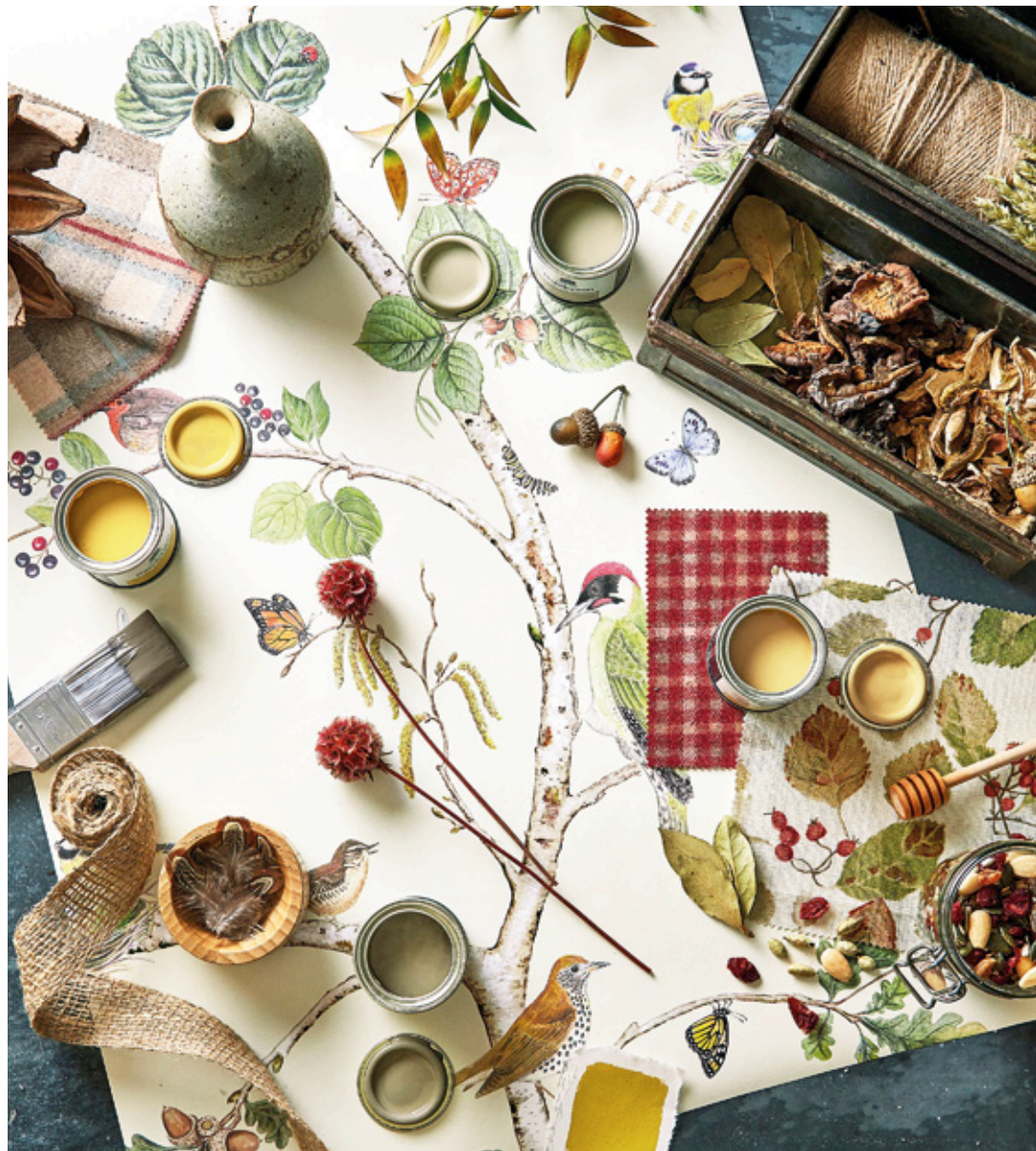
WALLPAPER WOODLAND CHORUS 215703