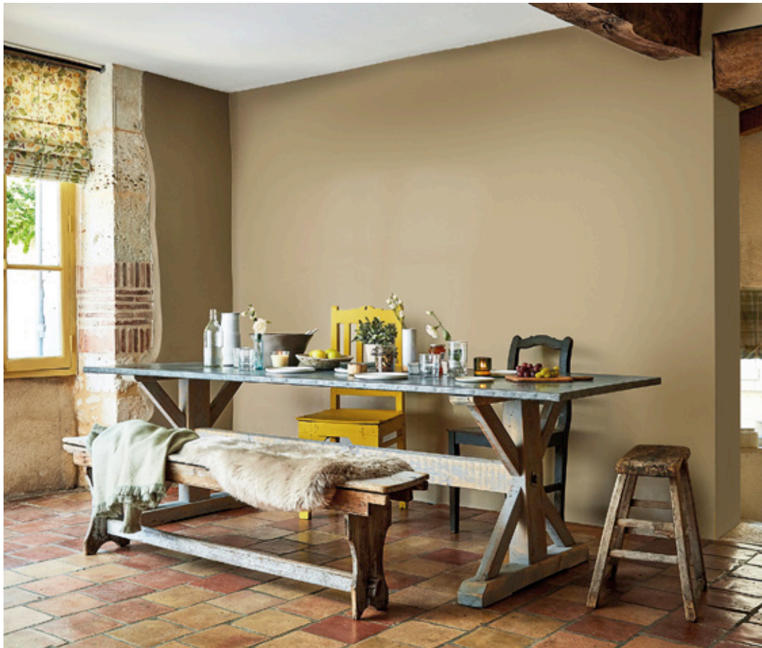
WALL BRIARWOOD CHAIR WOODLAND YELLOW