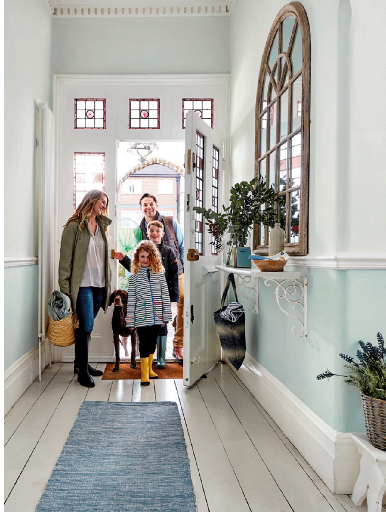
TOP SILVER FROST BOTTOM EMBLETON BAY WOODWORK SNOWY OWL

The best days out are those where you come home and hold onto the magic for a little longer.