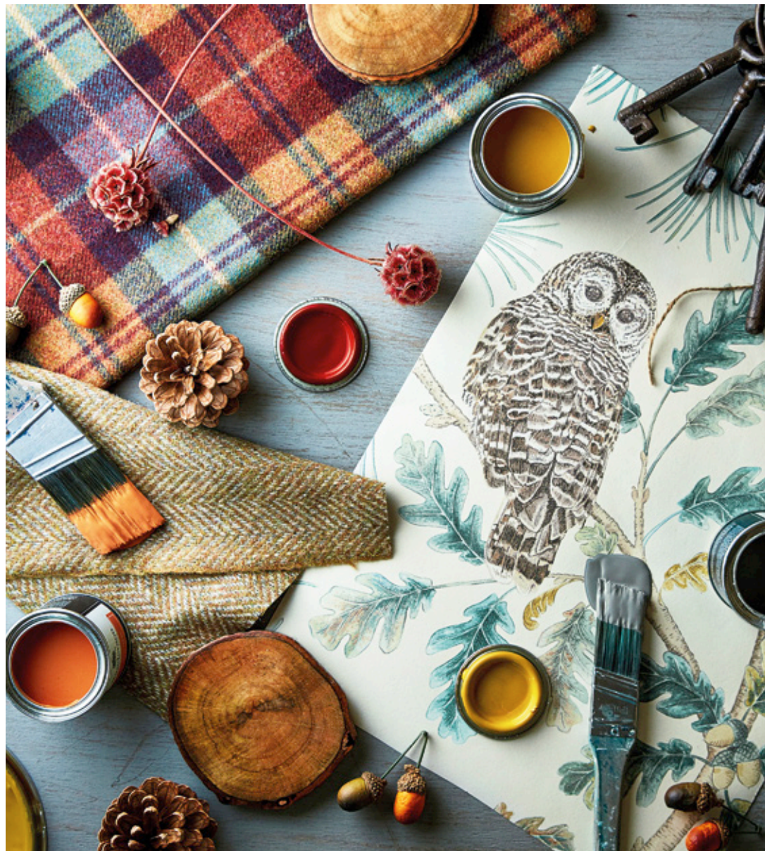
WALLPAPER OWLSWICK 216959 WOOLS FENTON CHECK 236742, HECTOR 236755